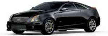
BLACK DIAMOND TRICOAT 1